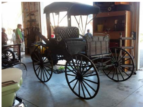
The Kramers' collection includes this antique doctor's buggy (the buggy not the doctor) complete with medicine bag.